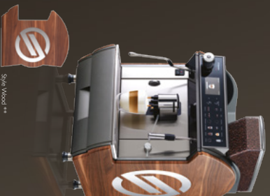
Style Wood **