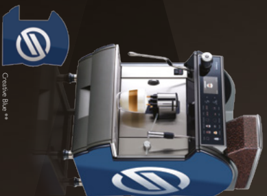
Creative Blue **