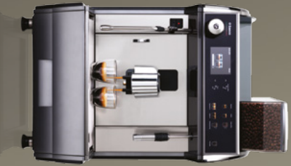
Idea Resstyle Luxe