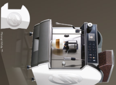
Minimal White **