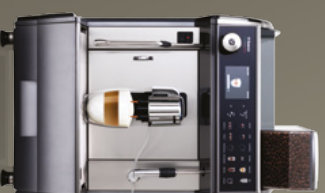
Idea Restyle Cappuccino