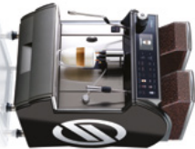
Idea Restyle Duo