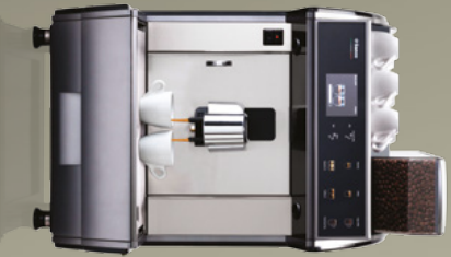
Idea Resstyle Coffee