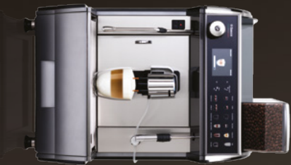
Idea Resstyle Cappuccino