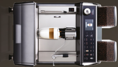
Idea Resstyle Duo