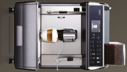
Idea Resstyle Power Steam