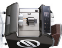
Idea Restyle Coffee