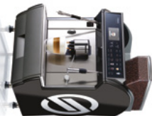
Idea Restyle Power Steam