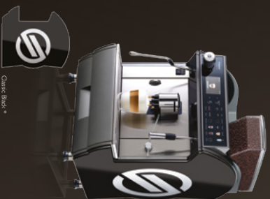
Classic Black **

CREATE YOUR STYLE WITH THE 5 NEW COLOURS.