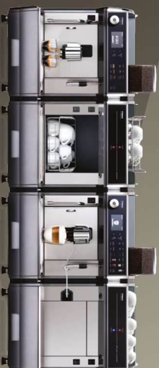
Idea Restyle Luxe + Idea Restyle Cups + Idea Restyle Cappuccino + Idea Restyle Milk

* standard version ** couple of pods sold as accessory