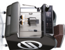
Idea Restyle Luxe