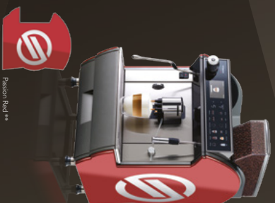
Passion Red **